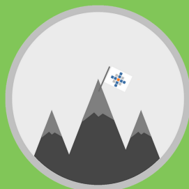
Use positive approaches