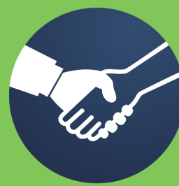
Follow the good manners code