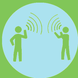
Use an appropriate tone