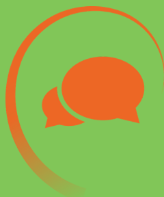
Do not offend