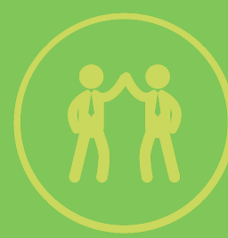
Treat colleagues with respect