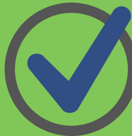
Avoid to remain a bystander